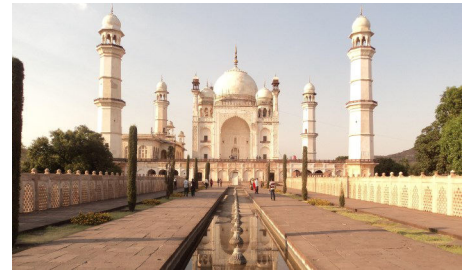
Bibi Ka Maqbara

Nanded, Paithan, Pithalkora Caves and Shani Shingnapur are some of the other major tourist attractions near Aurangabad.