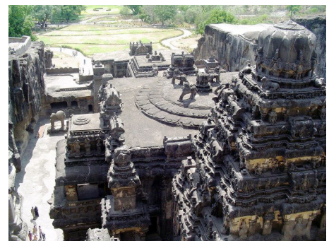
Kailash Temple, Ellora Caves